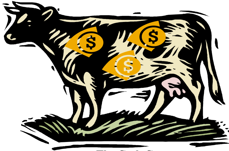
The Cash Cow

“When it comes to money, you only screw it up once”